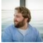
Jason Gray @jasonmgray

@jasonmgray just entered the conversation. Where r the guidelines? Interested in an essay re: a short story by a deceased Mexican writer?