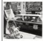
Black Yoda Yogi @BlackYodaYogi

@BlackYodaYogi @awpwriter Yes, I'm sure that is frustrating. We certainly want to be open to everyone here. I hope you'll give us a try.