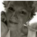
Rebecca Gummere @rgummere

Want to see all of our previous Writer's Notebook blog posts? We've got a Pinterest board for that! https://www.pinterest.com/awpwriter/the-writers-notebook/ ... #AWPsubs