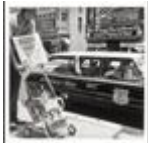
Black Yoda Yogi @BlackYodaYogi

Writers of color: We don't hear from you enough! We want to read your work. #AWPsubs