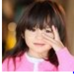
Mariecor Agravante @WriterMariecor

Submit as clean and well-prepared a manuscript as possible. Please! #AWPsubs