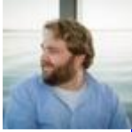
Jason Gray @jasonmgray

@jasonmgray Footnotes or endnotes for researched articles? MLA style? #awpsubs