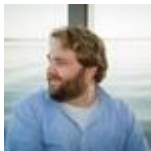
Jason Gray @jasonmgray

We pay! Good money. $18/100 words for Chronicle and Career Advice articles. $100 for a blog post. #AWPsubs