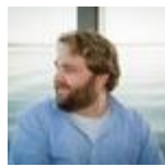
Jason Gray @jasonmgray

@jasonmgray Also, what grants are offered by AWP? Thanks again :)