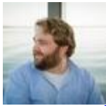
Jason Gray @jasonmgray

No need to query--just go ahead and submit. #AWPsubs