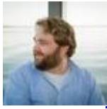
Jason Gray @jasonmgray

Submit as clean and well-prepared a manuscript as possible. Please! #AWPsubs