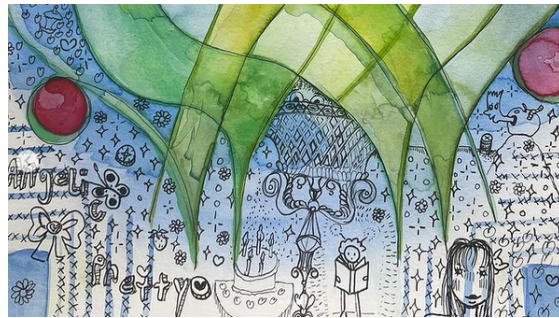
From "Flower" series © Carolin Wood; used by permission